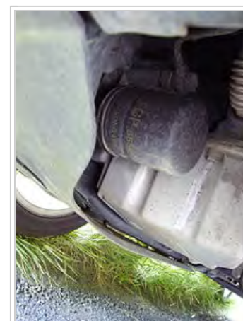
Spin-on oil filter on a Saab 9-5