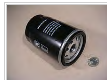
Spin-on oil filter, showing seal and screw-on thread