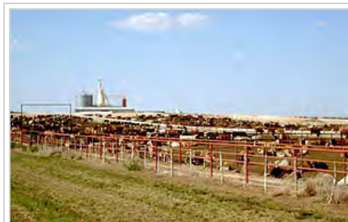
A photo of a feedlot in Texas, USA, where cattle are "finished" (fattened on grains) prior to slaughter.