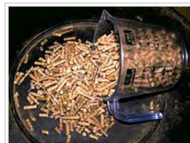
A pelleted ration designed for horses

Leading U.S. companies involved in prepared feeds production in the early first decade of the 21st century included ConAgra Inc., an Omaha, Nebraska-based firm; and Cargill, Incorporated, a diversified company that was the nation's top exporter of grain. In 1998, Ralston Purina Company, based in St. Louis, Missouri, formed Agribands International, Inc. to control its international animal feed and agricultural products division. Agribands produced feed and other products for livestock in markets outside of the United States, and had about 75 facilities operating in 16 countries. In 2001, it was acquired by Cargill.