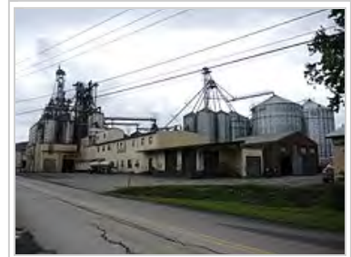
Feed production facility in Oneonta, New York