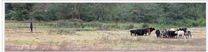
In this photo a herdsman from the Masaai people watches as his cattle graze in the Ngorongoro crater, Tanzania.