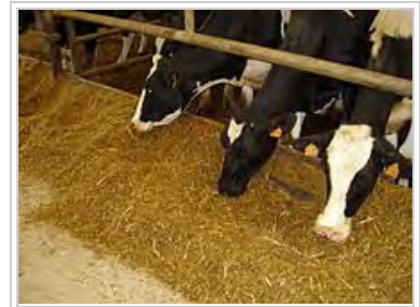
Cattle eating a total mixed ration