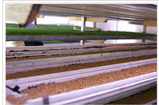
A fodder factory set up by an individual farmer to produce customised cattle feed

Fodder , a type of animal feed, is any agricultural foodstuff used specifically to feed domesticated livestock, such as cattle, goats, sheep, horses, chickens and pigs. "Fodder" refers particularly to food given to the animals (including plants cut and carried to them), rather than that which they forage for themselves (called forage). Fodder ( / ˈ f ɒ d ə r / ) is also called provender ( / ˈ p r ɒ v ə n d ə r / ) and includes hay, straw, silage, compressed and pelleted feeds, oils and mixed rations, and sprouted grains and legumes (such as bean sprouts, fresh malt, or spent malt). Most animal feed is from plants, but some manufacturers add ingredients to processed feeds that are of animal origin.