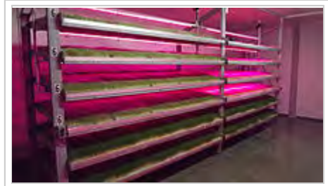
A "grow deck" commercial sprouting system