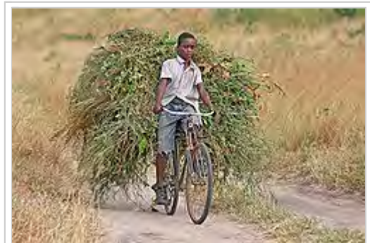
Cut green fodder being transported to cattle in Tanzania