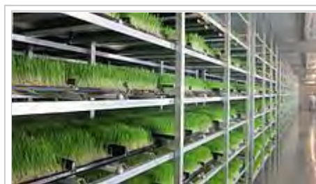
On site system in the USA.