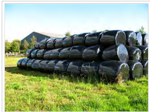
Newton of Cawdor stack of bales, sweet-smelling fodder stored for winter