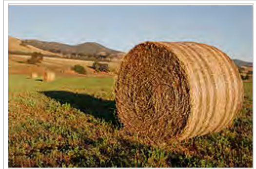
Round hay bales