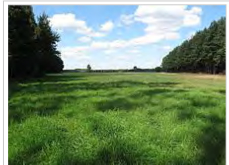
Meadow of perennial ryegrass ( Lolium perenne )