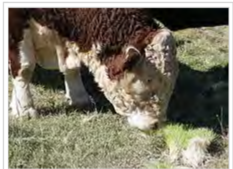
Bull feeding on grass