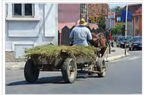
Horse-drawn transport of fodder in Romania