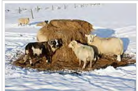
Sheep with silage