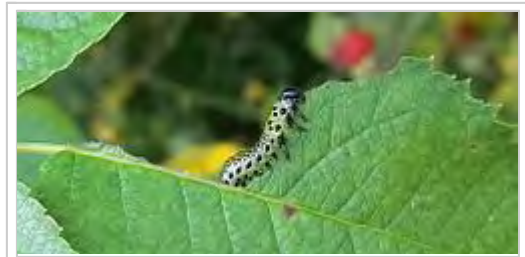
A caterpillar feeding on a leaf