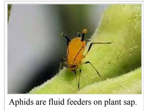
Aphids are fluid feeders on plant sap.

Feeding choice involves which plants a herbivore chooses to consume. It has been suggested that many herbivores feed on a variety of plants to balance their nutrient uptake and to avoid consuming too much of any one type of defensive chemical. This involves a tradeoff however, between foraging on many plant species to avoid toxins or specializing on one type of plant that can be detoxified. [28]