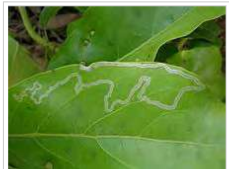
Leaf miners feed on leaf tissue between the epidermal layers, leaving visible trails

Herbivores form an important link in the food chain; because they consume plants in order to digest the carbohydrates photosynthetically produced by a plant. Carnivores in turn consume herbivores for the same reason, while omnivores can obtain their nutrients from either plants or animals. Due to a herbivore's ability to survive solely on tough and fibrous plant matter, they are termed the primary consumers in the food cycle (chain). Herbivory, carnivory, and omnivory can be regarded as special cases of Consumer-Resource Systems. [15]