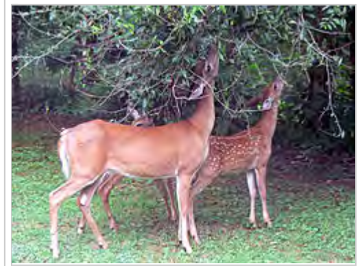
A deer and two fawns feeding on foliage

A large percentage of herbivores have mutualistic gut flora that help them digest plant matter, which is more difficult to digest than animal prey. [1] This gut flora is made up of cellulose-digesting protozoans or bacteria living in the herbivores' intestines. [2]