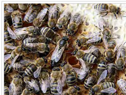
Carniolan queen bee with attendants on a honeycomb.

The term "queen bee" can be more generally applied to any dominant reproductive female in a colony of a eusocial bee species other than honey bees. However, as in the Brazilian stingless bee Schwarziana quadripunctata , a single nest may have multiple queens or even dwarf queens, ready to replace a dominant queen in a case of sudden death. [2]