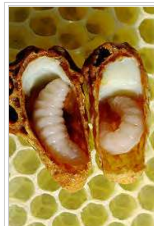
Older queen larvae in queen cell lying on top of wax comb

Queens are raised in specially constructed queen cells. The fully constructed queen cells have a peanut-like shape and texture. Queen cells start out as queen cups. Queen cups are larger than the cells of normal brood comb and are oriented vertically instead of horizontally. Worker bees will only further build up the queen cup once the queen has laid an egg in a queen cup. In general, the old queen starts laying eggs into queen cups when conditions are right for swarming or supersedure. Swarm cells hang from the bottom of a frame while supersedure queens or emergency queens are generally raised in cells built out from the face of a frame.