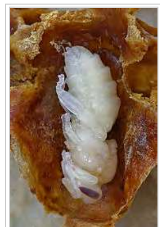
Capped queen cell opened to show queen pupa (with darkening eyes).