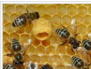
A queen cup

When conditions are favorable for swarming, the queen will start laying eggs in queen cups. A virgin queen will develop from a fertilized egg. The young queen larva develops differently because it is more heavily fed royal jelly, a protein-rich secretion from glands on the heads of young workers. If not for being heavily fed royal jelly, the queen larva would have developed into a regular worker bee. All bee larvae are fed some royal jelly for the first few days after hatching but only queen larvae are fed on it exclusively. As a result of the difference in diet, the queen will develop into a sexually mature female, unlike the worker bees.