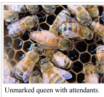
Unmarked queen with attendants.

Although the name might imply it, a queen bee does not directly control the hive. Her sole function is to serve as the reproducer. A well-mated and well-fed queen of quality stock can lay about 1,500 eggs per day during the spring build-up—more than her own body weight in eggs every day. She is continuously surrounded by worker bees who meet her every need, giving her food and disposing of her waste. The attendant workers also collect and then distribute queen mandibular pheromone, a pheromone that inhibits the workers from starting queen cells. [7]