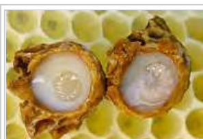
Queen larvae floating on royal jelly in opened queen cups laid on top of wax comb.

When conditions are favorable for swarming, the queen will start laying eggs in queen cups. A virgin queen will develop from a fertilized egg. The young queen larva develops differently because it is more heavily fed royal jelly, a protein-rich secretion from glands on the heads of young workers. If not for being heavily fed royal jelly, the queen larva would have developed into a regular worker bee. All bee larvae are fed some royal jelly for the first few days after hatching but only queen larvae are fed on it exclusively. As a result of the difference in diet, the queen will develop into a sexually mature female, unlike the worker bees.