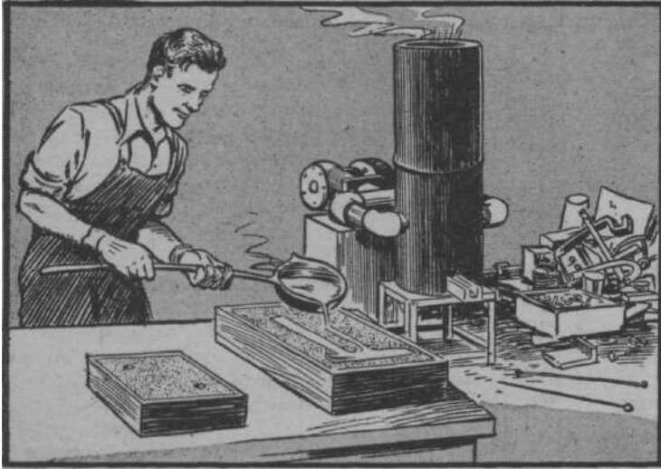
One man can easily handle this cupola. It will melt 35 lbs. of iron at a time, or about 300 lbs. per hour.

I RON can be melted in small quantities, and very inexpensively with the small cupola described in this article. The simple materials for its construction are obtainable almost anywhere. One man can easily take care of the furnace, charging the coke and metal, tapping and pouring. Under ordinary conditions it will melt about 330 pounds of metal per hour. This can be increased to 400 pounds per hour, but such rapid melting is hard on the lining and is not recommended.