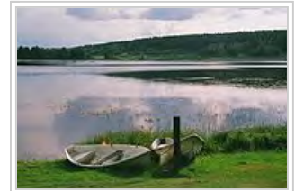
Typical Finnish rowing boats on the shore of Palokkajärvi, Jyväskylä