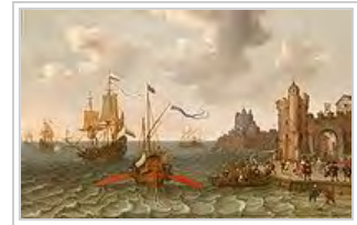
A French galley and Dutch man-of-war off a port

Design details are a compromise between competing factors. If the waterline beam (width) is too narrow the boat will be tender and the occupant at risk of falling out, if the beam is too wide the boat will be slow and have more resistance to waves. If the freeboard (height of the gunwale above the waterline) is too high then windage will be high and as a result the boat will be caught by the wind and the rower will not be able to control the boat in high winds. If the freeboard is too low, water will enter the boat through waves. If the boat is designed for one person then only a single rowing position is required. If the rower is to carry a passenger at the stern then the boat will be stern heavy and trim will be incorrect. To correct this a weight can be added in the bow, alternatively the boat can supply a second rowing position further forward for this purpose. For a boat to have three separate thwarts and have adequate space for each occupant then the boat has to be of a certain minimum size. A 2.4-meter (8 ft) pram dinghy can carry 4 passengers on 3 thwarts in flat seas. The ideal size of a good row boat intended for distance rowing is 5 m (16 ft).