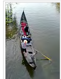
A Gondola in Venice