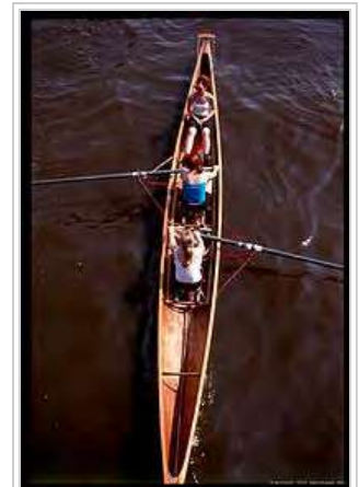
Rowing in the Amstel River by a student rowing club.