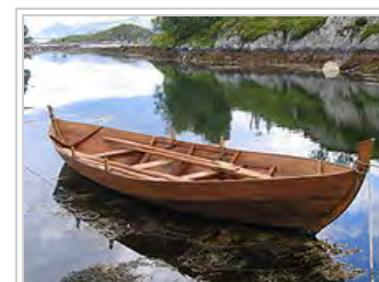
A Sunnmørsfering ; a Norwegian four-oared rowing boat, from the region Sunnmøre (Herøy kystmuseum, Herøy, Møre og Romsdal, Norway)