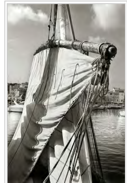
A lateen sail

Kites that are used to propel certain sailing craft are differentiated from sails in that they are supported and controlled by lines that lead from the kite to the craft.