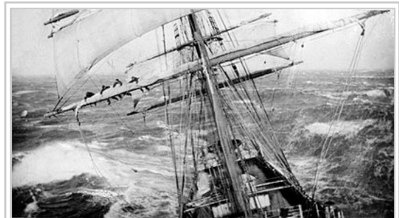
Ship Garthsnaid at sea c. 1920. Men can be seen in the rigging.

The square rig, which reached its maximum development in the clipper ships and trading barques of the late 19th and early 20th century, relies on rectangular sails hung beneath yards, themselves suspended from the masts and set "square" (i.e., at a right angle to) the keel of the ship. This kind of rig requires an enormous amount of rigging (at least nine ropes per sail) and cannot sail closer than about 60° to the wind. Few vessels of this type are seen today, other than the spectacular ones used for sail training. Most square rigged vessels also carry at least some fore-and-aft sails.