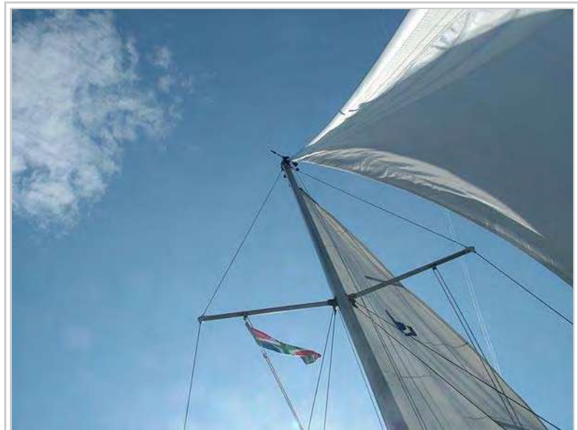
Yacht sails seen from the deck

A spinnaker is also used on some boats to help move the sailboat faster downwind. The spinnaker is often a colourful sail and can be either symmetrical or asymmetrical.