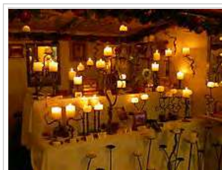
A room lit up in the glow of many candles

The luminous intensity of a typical candle is approximately one candela. The SI unit, candela, was in fact based on an older unit called the candlepower , which represented the luminous intensity emitted by a candle made to particular specifications (a "standard candle"). The modern unit is defined in a more precise and repeatable way, but was chosen such that a candle's luminous intensity is still about one candela.