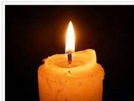
Candle at Night - Closeup View

In the days leading to Christmas some people burn a candle a set amount to represent each day, as marked on the candle. The type of candle used in this way is called the Advent candle , [16] although this term is also used to refer to a candle that decorates an Advent wreath.