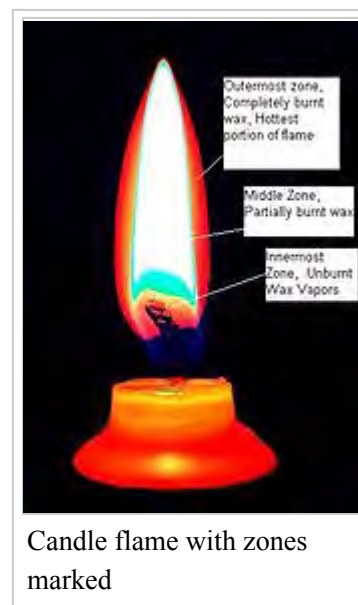
Candle flame with zones marked

The main determinant of the height of a candle flame is the diameter of the wick. This is evidenced in tealights where the wick is very thin and the flame is very small. Candles whose main purpose is illumination use a much thicker wick. [24]