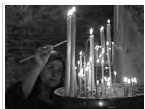
Candle lighting in the Visoki Dečani monastery.