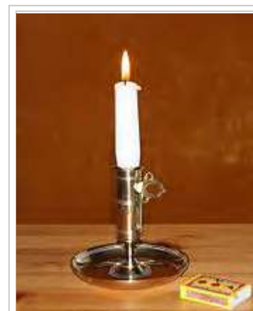
A candle in a candle stick

As the mass of solid fuel is melted and consumed, the candle becomes shorter. Portions of the wick that are not emitting vaporized fuel are consumed in the flame. The incineration of the wick limits the exposed length of the wick, thus maintaining a constant burning temperature and rate of fuel consumption. Some wicks require regular trimming with scissors (or a specialized wick trimmer), usually to about one-quarter inch (~0.7 cm), to promote slower, steady burning, and also to prevent smoking. In early times, the wick needed to be trimmed quite frequently. Special candle-scissors, referred to as "snuffers" were produced for this purpose in the 20th century and were often combined with an extinguisher. In modern candles, the wick is constructed so that it curves over as it burns. This ensures that the end of the wick gets oxygen and is then consumed by fire—a self-trimming wick. [3]