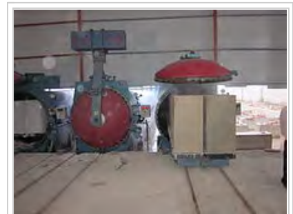
On the right, green AAC blocks are being fed into an autoclave to be rapidly cured under heat and pressure