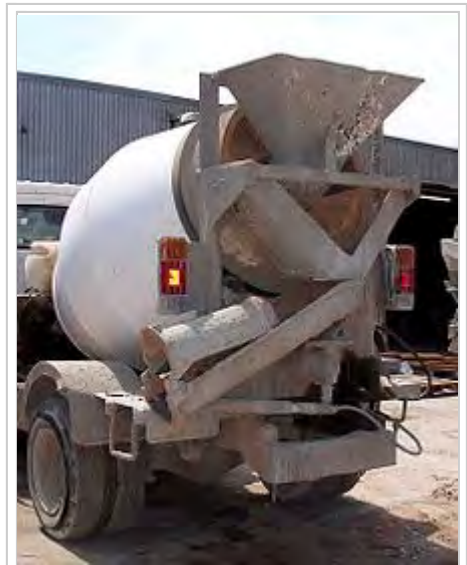
1.6 cuM. transit mixer