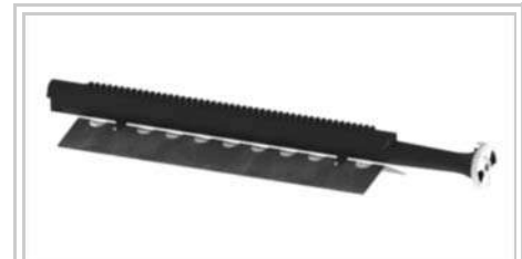
Charbroiler burner – straight cast with under-burner deflector

As a general practice charbroilers are operated in the fully ON position, due to the relative inability to control surface temperature with the low range offered by the valves. As illustrated by the temperature profiles of the