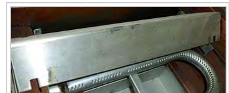
Charbroiler radiant – sheet metal