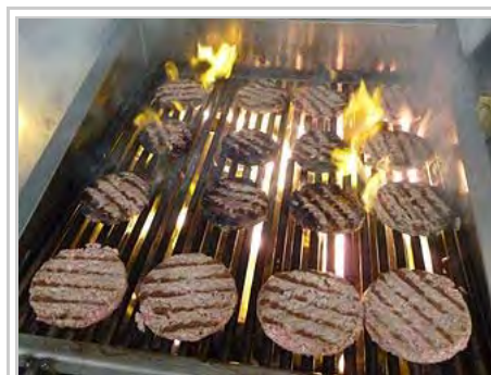
Hamburgers cooking on a charbroiler