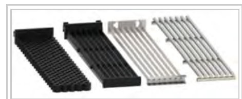
Charbroiler – grates