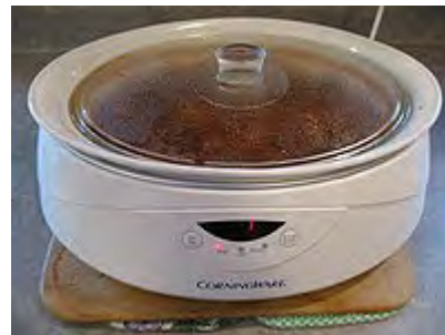
An slow cooker with button controls and a digital timer