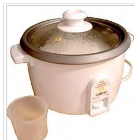
Inexpensive electric rice cooker containing cooked rice

The rice is measured and added to the inner bowl or washed in a separate bowl (it is not recommended to wash rice in the inner bowl itself) in order to remove loosened starch and residual bran. Strainers are often used in the washing and draining process. For better texture and taste, some types of rice, e.g., Japanese rice or Calrose rice which is suited for absorption method, require pre-cooking water absorption. The water absorption step typically involves letting the rice stand for at least 5 min after draining water from the washing step and soaking the rice in the measured water for at least 15 min (or some claim it to be 1 hour) before cooking. The water draining step is colloquially believed to make the water measurement more accurate, if the water is measured and added after the initial water absorption that takes place in the washing step. Some people prefer to achieve the water absorption by simply leaving the rice soaking in the rice cooker overnight before starting cooking in the morning. Some other types of rice, e.g., long-grain rice or scented rice such as jasmine rice, do not require washing or the water absorption step. The water for cooking is added to the inner bowl by using measuring cups or simply filling up to the appropriate graduated mark in the inner bowl. Although cold water is normally added, boiling water is used for cooking sushi rice.