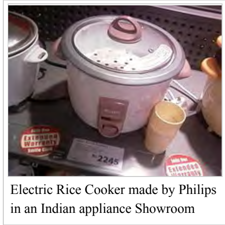
Electric Rice Cooker made by Philips in an Indian appliance Showroom

In the 2000s, more deluxe models appeared on the market and attracted much attention. These models are characterized by non-metallic materials for inner cooking bowls to employ thermal far-infrared radiation in order to improve the taste of cooked rice. In 2006 Japanese Mitsubishi Electric corporation produced an expensive cooker which used an inner cooking bowl called honsumigama (本炭釜) made of hand-carved pure carbon, with a better heat-generating profile with induction cooking. Despite the high price (¥115,500, about US$1,400 at the time), it sold 10,000 units within six months after it was introduced. It was a huge success and it set the trend of extremely high-end models in the market. There is also a product which uses pottery, e.g., Arita-yaki, for the inner cooking bowl. There have been pottery-based electric cooking appliances in China since the 1980s, and in recent years rice cookers have been also produced. Some other materials used for luxurious rice bowls are pure copper, ceramic-iron layers, and diamond coating. These rice cooker makers research what the best cooked rice means (in taste and texture) and attempt to realize "the best cooked rice" in electric rice cookers by using various inventions. Most regard rice cooked either in a traditional rice cooker used in hearth or in a gas pressure cooker as references, and attempt to achieve or exceed the same.