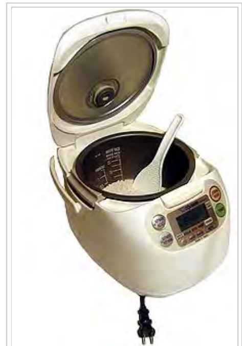
Electric rice cooker, including scoop, containing uncooked rice