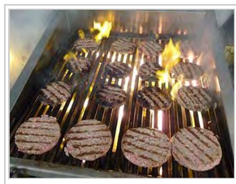
Hamburgers cooking on a charbroiler

process used when an item is cooked on a grated surface to sear in the flavors and impart a degree of charring which gives the product a light charcoal smoke flavor."<sup>[1][2]</sup>