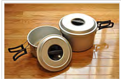
An aluminum cooker