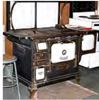
A wood burning iron kitchen stove