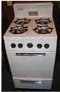
A gas stove