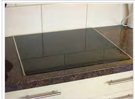
Top view of an induction stove