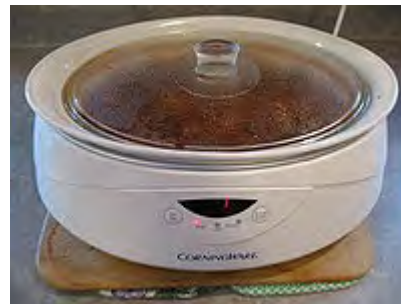
An slow cooker with button controls and a digital timer