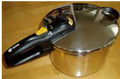
A pressure cooker