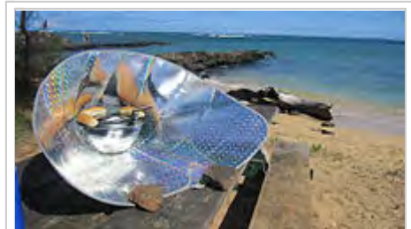
Hot dogs being cooked with a solar funnel cooker