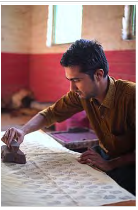
Traditional hand block print Handicrafts artisan in India

Collective terms for handicrafts include artisanry , handicrafting , crafting , and handicraftsmanship . The term arts and crafts is also applied, especially in the United States and mostly to hobbyists' and children's output rather than items crafted for daily use, but this distinction is not formal, and the term is easily confused with the Arts and Crafts design movement, which is in fact as practical as it is aesthetic.