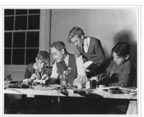
Works Progress Administration, Crafts Class, 1935.

craftspeople played, and today many handicrafts are increasingly seen, especially when no longer the mainstay of a formal vocational trade, as a form of hobby, folk art and sometimes even fine art.