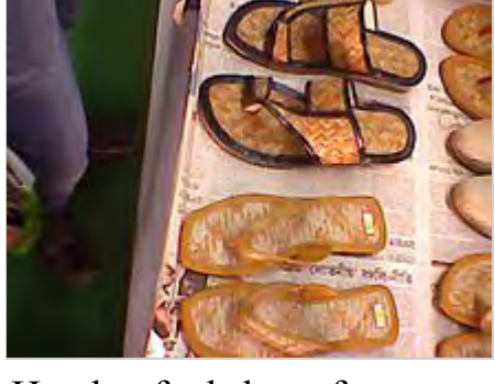
Handcrafted shoes from bamboo made by artists of West Bengal, India, at a fair in Kolkata