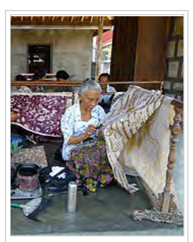
Batik craftswomen in Java, Indonesia drawing batik.