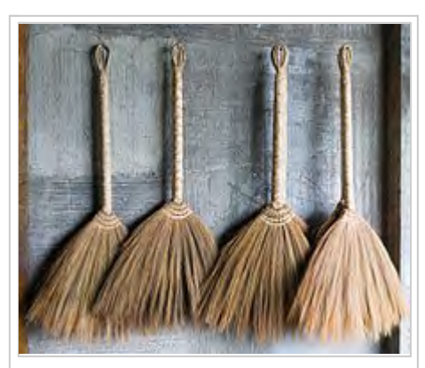
Typical Filipino handmade brooms in a restaurant of Banaue Municipal Town.