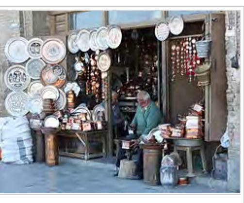
A handicraft Selling-Factory shop, Isfahan-Iran