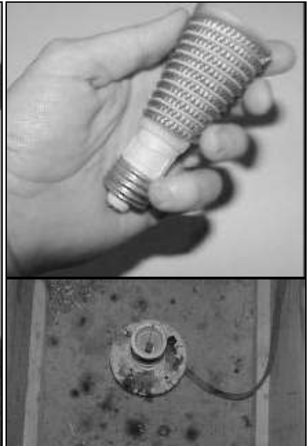
Left: The dryer cabinet and the polycarbonate trays. Right: The 600-watt ceramic heat coil screws into an ordinary porcelain lamp base.

Whatever the size or material of your trays, design the cabinet size around them allowing for sufficient room below for the heat element and room to easily fit the trays within. I am providing the measurements below to serve only as a guide for your own construction process, because the type and size of trays that you come up with may vary from that which I devised. Our dryer measures 48" tall by 14¾" wide by 16" deep. The trays themselves measure 13¾" square. A slightly different size tray is available from Excalibur Dehydrators, listed at the end of this article.