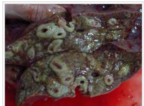
Hypertrophy of bile ducts in liver caused by F. hepatica (liver section of an infested goat)