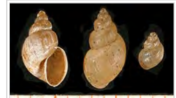
Galba truncatula - the most common intermediate host of F. hepatica in Europe and South America

In animals, intravital diagnosis is based predominantly on faeces examinations and immunological methods. However, clinical signs, biochemical and haematological profile, season, climate conditions, epidemiology situation, and examinations of snails must be considered. [12][24] Similarly to humans, faeces examinations are not reliable. Moreover, the fluke eggs are detectable in faeces 8–12 weeks