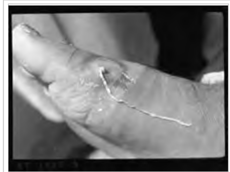
Example clinical photo: Guinea worm infection (dracunculiasis), worm coming out of the foot of an infected person.