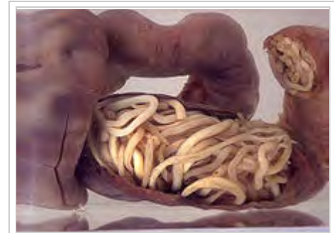
Piece of intestine, blocked by worms, surgically removed from a 3-year-old boy in South Africa. [51]