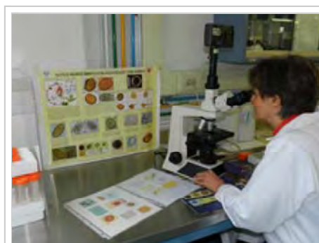
Identification and quantification of helminth eggs at UNAM university in Mexico City, Mexico

Specific helminths can be identified through microscopic examination of their eggs (ova) found in faecal samples. The number of eggs is measured in units of eggs per gram. [29] However, it does not quantify mixed infections, and in practice, is inaccurate for quantifying the eggs of schistosomes and soil-transmitted helminths. [30] Sophisticated tests such as serological assays, antigen tests, and molecular diagnosis are also available; [29][31] however, they are time-consuming, expensive and not always reliable. [32]