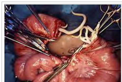
Example of ascariasis (ascaris infection) - Difficult surgical procedure in South Africa on a gangrenous piece of bowel that had to be cut out; live ascaris worms are emerging.

Some types of helminthiasis are classified as neglected tropical diseases. [1][52] They include: