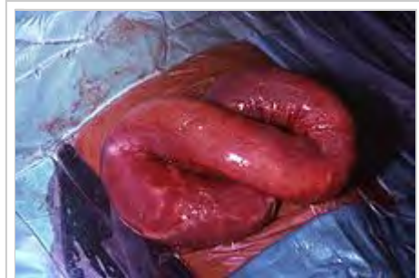
Ascaris infection: Antimesenteric splitting of the outer layers of the bowel wall due to a large amount of ascaris (South Africa)