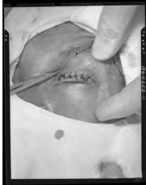
Surgical repair of in-turned eyelid and eyelashes resulting from trachoma