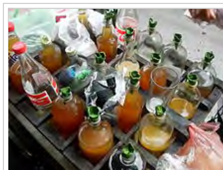
Different types of Indonesian jamu herbal medicines held in bottles.

In Indonesia, especially among the Javanese, the jamu traditional herbal medicine is an age old tradition preserved for centuries. Jamu is thought to have originated in the Mataram Kingdom era, some 1300 years ago. [69] The bas-reliefs on Borobudur depicts the image of people ground herbs with stone mortar and pestle, drink seller, physician and masseuse treating their clients. [70] All of these scenes might be interpreted as a traditional herbal medicine and health-related treatments in ancient Java. The Madhawapura inscription from Majapahit period mentioned a specific profession of herbs mixer and combiner (herbalist), called Acaraki . [70] The medicine book from Mataram dated from circa 1700 contains 3,000 entries of jamu herbal recipes, while Javanese classical literature Serat Centhini (1814) describes some jamu herbal concoction recipes. [70]