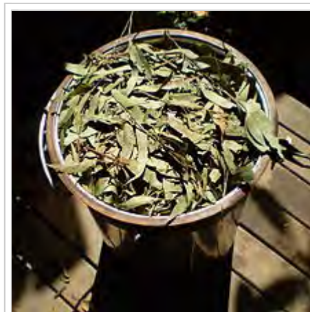
Leaves of Eucalyptus olida being packed into a steam distillation unit to gather its essential oil.

Many herbs are applied topically to the skin in a variety of forms. Essential oil extracts can be applied to the skin, usually diluted in a carrier oil. Many essential oils can burn the skin or are simply too high dose used straight; diluting them in olive oil or another food grade oil such as almond oil can allow these to be used safely as a topical. [30] Salves, oils, balms, creams and lotions are other forms of topical delivery mechanisms. Most topical applications are oil extractions of herbs. Taking a food grade oil and soaking herbs in it for anywhere from weeks to months allows certain phytochemicals to be extracted into the oil. This oil can then be made into salves, creams, lotions, or simply used as an oil for topical application. Many massage oils, antibacterial salves, and wound healing compounds are made this way.