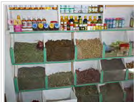
A herb shop in the souk of Marrakesh, Morocco

One can also make a poultice or compress using the whole herb or the appropriate part of the plant, which is usually crushed or dried and re-hydrated with a small amount of water and then applied directly in a bandage, cloth, or just as is.