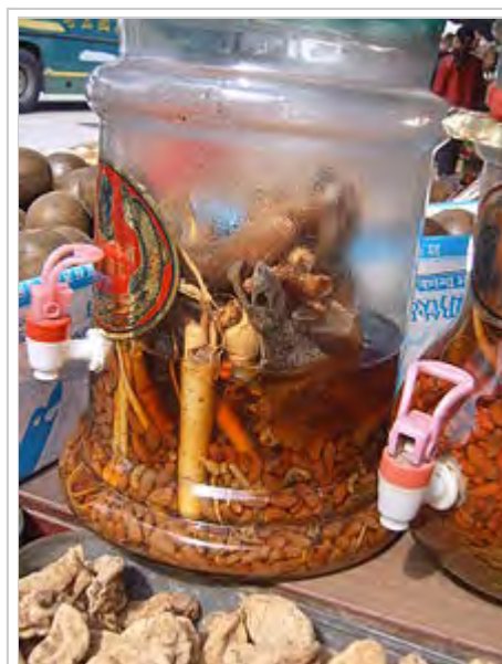
Ready to drink macerated medicinal liquor with goji berry, tokay gecko, and ginseng, for sale at a traditional medicine market in Xi'an, China.

In Ladakh, Lahul-Spiti and Tibet, the Tibetan Medical System is prevalent, also called the 'Amichi Medical System'. Over 337 species of medicinal plants have been documented by C.P. Kala. Those are used by Amchis, the practitioners of this medical system. [66][67]