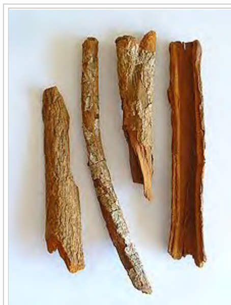
The bark of the cinchona tree contains quinine, which today is a widely prescribed treatment for malaria, especially in countries that cannot afford to purchase the more expensive anti-malarial drugs produced by the pharmaceutical industry.

There are many forms in which herbs can be administered, the most common of which is in the form of a liquid that is drunk by the patient—either an herbal tea or a (possibly diluted) plant extract. [25] Whole herb consumption is also practiced either fresh, in dried form or as fresh juice.