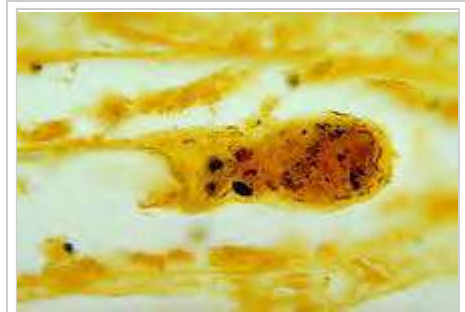
Kidney tissue, using a silver staining technique, revealing the presence of Leptospira bacteria

Differential diagnosis list for leptospirosis is very large due to diverse symptoms. For forms with middle to high severity, the list includes dengue fever and other hemorrhagic fevers, hepatitis of various etiologies, viral