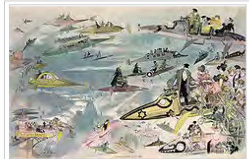
Print (c. 1902) by Albert Robida showing a futuristic view of air travel over Paris in the year 2000 as people leave the opera.

More generally, one can regard science fiction as a broad genre of fiction that often involves speculations based on current or future science or technology. Science fiction is found in books, art, television, films, games, theater, and other media. Science fiction differs from fantasy in that, within the context of the story, its imaginary elements are largely possible within scientifically established or scientifically postulated laws of nature (though some elements in a story might still be pure imaginative speculation). Settings may include the future, or alternative time-lines, and stories may depict new or speculative scientific principles (such as time travel or psionics), or new technology (such as nanotechnology, faster-than-light travel or robots). Exploring the consequences of such differences is the traditional purpose of science fiction, making it a "literature of ideas". [12]