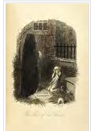
The Ghost of Christmas Yet to Come shows Scrooge his future in Dickens' A Christmas Carol .

The concept of the future has been explored extensively in cultural production, including art movements and genres devoted entirely to its elucidation, such as the 20th century movement futurism.