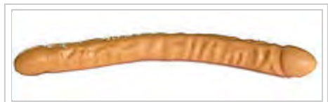
Latex double dildo