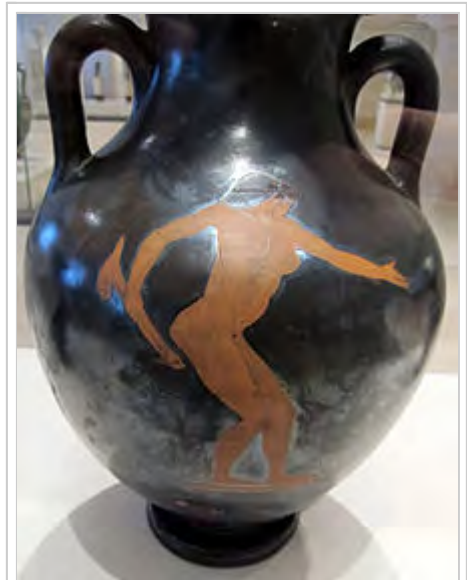
A woman with a dildo. Red figure amphora attributed to the Flying-Angel Painter c. 490 BC; City of Paris Museum of Fine Arts

She eventually discovers the maker to be a man called Kerdon, who hides his trade by the front of being a cobbler, and leaves to seek him out. Metro and Kerdon are main characters in the next play in the sequence, Mime VII , when she visits his shop.