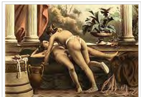
Dildo being used by two women. Lithograph from De Figuris Veneris (1906) by Édouard-Henri Avril