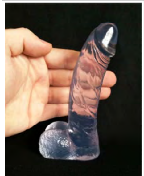
5.5 inch clear jelly dildo