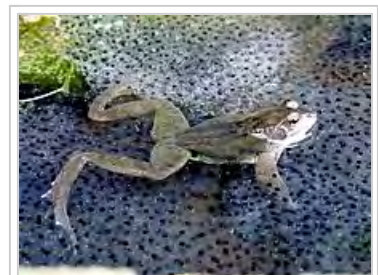
A male common frog in nuptial colors waiting for more females to come in a mass of spawn