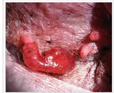
A newborn joey suckles from a teat found within its mother's pouch

Fish exhibit a wide range of different reproductive strategies. Most fish however are oviparous and exhibit external fertilization. In this process, females use their cloaca to release large quantities of their gametes, called spawn into the water and one or more males release "milt", a white fluid containing many sperm over the unfertilized eggs. Other species of fish are oviparous and have internal fertilization aided by pelvic or anal fins that are modified into an intromittent organ analogous to the human penis. [9] A small portion of fish species are either viviparous or ovoviviparous, and are collectively known as livebearers. [10]