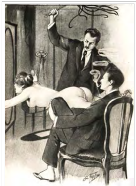
Inflicting pain upon others is a common fantasy of sex offenders, which may include spanking as illustrated in the above image. Produced by Lewis Bald in 1913.

They occur in high prevalence alongside other paraphilic fantasies in psychopaths and individuals with dark triad traits. [90] High narcissism correlate strongly with impersonal sexual fantasies [96] and studies suggested that the deviant and sadistic sexual fantasies serve as a coping mechanism for narcissistic vulnerability [79] Higher levels of psychopathy are associated with, impersonal, unrestricted, deviant, [97] paraphilic and wide ranges of sexual fantasies. [96] However, it has been suggested that this is due to an increased sex drive, which correlates with paraphilic interests. [98] Also, psychopathy increases the effect that porn has on the development of deviant fantasies such its contribution to the likelihood of engaging in rape fantasies. [97] The effects of psychopathy go further to increase likelihood of individuals carrying out their unrestricted deviant fantasies in real life [97] such as engaging in BDSM/sadomasochism or even rape. [90] However, BDSM fantasies have become quite common among the general population, [55] possibly due to its normalization by the popular Fifty Shades trilogy. The capitalization of the Fifty shades trilogy changed the perception of BDSM from being extreme, marginalized and dangerous to being fun fashionable and exciting [99] . Mainstreaming Fifty Shades has increased visibility and acceptability of BDSM and has embedded it in everyday life. [99]