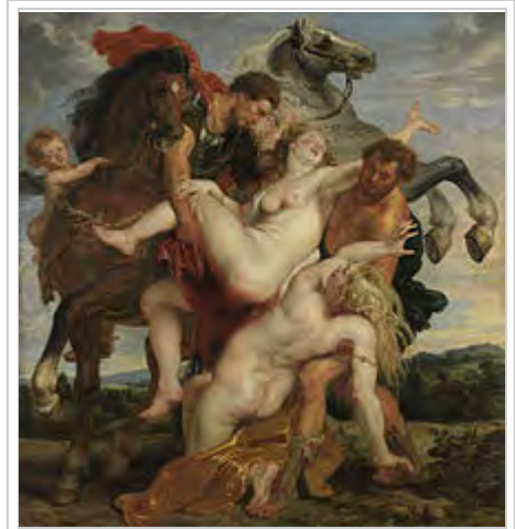
Rape fantasy is common in both men and women Image: Peter Paul Rubens - The Rape of the Daughters of Leucippus.jpg

The most frequently cited hypothesis for why women fantasize of being forced into some sexual activity is that the fantasy avoids societally induced guilt—the woman does not have to admit responsibility for her sexual desires and behavior. A 1978 study by Moreault and Follingstad was consistent with this hypothesis, and found that women with high levels of sex guilt were more likely to report fantasy themed around being overpowered, dominated, and helpless. In contrast, Pelletier and Herold used a different measure of guilt and found no correlation. Other research suggests that women who report forced sex fantasies have a more positive attitude towards sexuality, contradicting the guilt hypothesis. [65] [38] A 1998 study by Strassberg and Lockerd found that women who fantasized about force were generally less guilty and more erotophilic, and as a result had more frequent and more varied fantasies. Additionally, it said that force fantasies are clearly not the most common or the most frequent. [66]