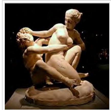
Deviant sexual fantasies involve nonconsensual, illegal and sadistic themes

Deviant sexual fantasies are sexual fantasies which involve illegal, nonconsensual, and sadistic themes. [74] While people with paraphilia have deviant sexual fantasies, it is important to note that deviant sexual fantasies are not atypical and/or paraphilic. DSM-5 defines paraphilia as intense and persistent atypical preferences for sexual activities or targets like spanking, whipping, binding with erotic targets like children, animals, and/or rubber etc. [75] While DSM-5 recognizes that paraphillias don't have to be pathological, psychiatrists still find it difficult to differentiate between paraphilic interests and paraphilic disorders, [75] because the concept of normal of sexual fantasies is subjective. It is based on factors like history, society, culture and politics. [75] For example, masturbation, oral, anal and homosexual sex were illegal in some American states and even considered to be paraphilic disorders in earlier DSM revisions.