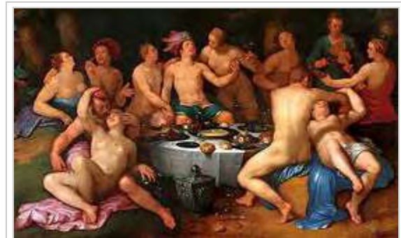
An artistic depiction of group sex; a sexual fantasy found to be more common in males. Produced by Cornelis van Haarlem in 1615.

The sexes also differ in terms of how much they fantasize about dominance and submission. Men fantasize equally often about dominance and submission, whereas women fantasize about submission more frequently than dominance. [49] Despite these differences, it is important to note that most individuals do not conform to these gendered sexual stereotypes, and that male sexuality is not innately aggressive, nor is female sexuality inherently passive, and that these stereotypes may decline with age. [48] Sexual fantasies may instead vary as a result of individual differences, such as personality or learning experiences, and not gender per se. [50] Indeed, it has been suggested that gender differences in sexual fantasies have actually narrowed over time, and may continue to do so, for example with regard to variety of sexual fantasy and the amount of fantasizing reported by each of the sexes. [51]