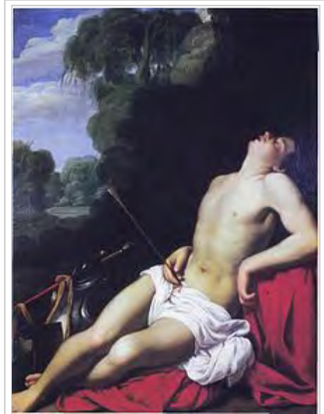
St. Sebastian has historically been depicted as both a religious icon and a figure of covert sexual fantasy