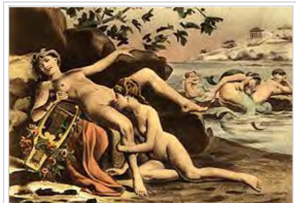
Oral sex is one of the most common fantasies among men and women

The sexes have been found to contrast with respect to where their fantasies originate from. Men tend to fantasize about past sexual experiences, whereas women are more likely to conjure an imaginary lover or sexual encounter that they have not experienced previously. [41] Male fantasies tend to focus more on visual imagery and explicit anatomic detail, with men being more interested in visual sexual stimulation and fantasies about casual sex encounters, regardless of sexual orientation. [42] On the other hand,