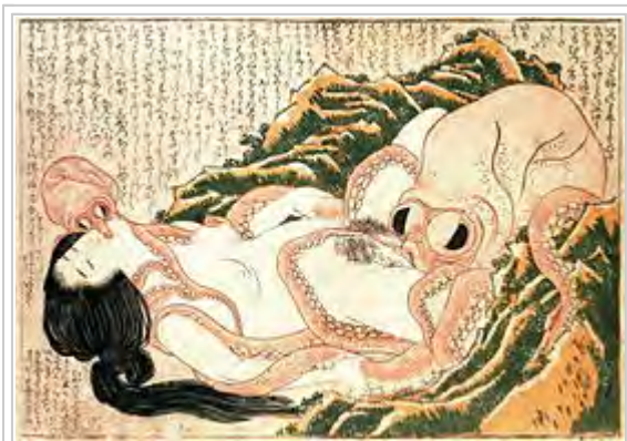
The Dream of the Fisherman's Wife by Hokusai is an artistic depiction of a sexual fantasy.

The scenarios for sexual fantasies vary greatly between individuals and are influenced by personal desires and experiences, and range from the mundane to the bizarre. Fantasies are frequently used to escape real-life sexual restraints by imagining dangerous or illegal scenarios, such as rape, castration, or kidnapping. [11] They allow people to imagine themselves in roles they do not normally have, such as power, innocence and guilt. [12] Fantasies have enormous influence over sexual behaviour and can be the sole cause of an orgasm. [13] While there are several common themes in fantasies, any object or act can be eroticized. [14]