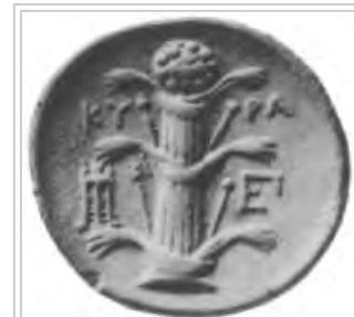
Ancient silver coin from Cyrene depicting a stalk of Silphium