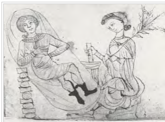
In this medieval image, a midwife prepares a pennyroyal mixture for a pregnant woman.

Common abortifacients used in performing medical abortions include mifepristone, which is typically used in conjunction with misoprostol in a two-step approach. [1] Oxytocin is commonly used to induce abortion in the second or third trimester. [2] There are also several herbal mixtures with abortifacient claims, though there are no available data on the efficacy of these plants in humans. [3]