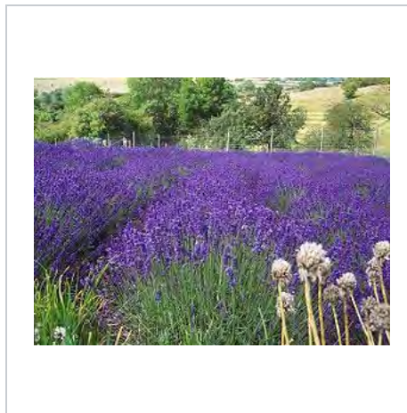
Lavender growing on a farm