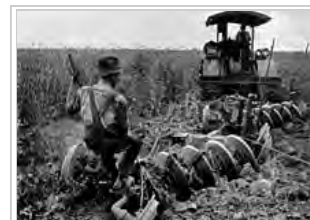
Early 20th-century image of a tractor ploughing an alfalfa field

The industrialization phase involved a continuing process of mechanization. Horse-drawn machinery such as the McCormick reaper revolutionized harvesting, while inventions such as the cotton gin reduced the cost of processing. During this same period, farmers began to use steam-powered threshers and tractors, although they