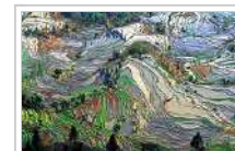
Terrace rice fields in Yunnan Province, China