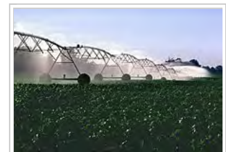
Overhead irrigation, center pivot designed