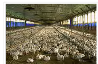
A commercial chicken house raising broiler pullets for meat.

Food and water is delivered to the animals, and therapeutic use of antimicrobial agents, vitamin supplements and growth hormones are often employed. Growth hormones are not used on chickens nor on any animal in the European Union. Undesirable behaviours often related to the stress of confinement led to a search for docile breeds (e.g., with natural dominance behaviours bred out), physical restraints to stop interaction, such as individual cages for chickens, or physically modification such as the de-beaking of chickens to reduce the harm of fighting.