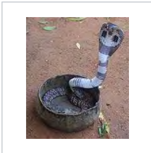
Naja naja , the spectacled cobra.