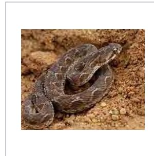
Echis carinatus , the saw-scaled viper.