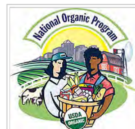
The National Organic Program (run by the USDA) is in charge of the legal definition of organic in the United States and does organic certification.

Psychological effects such as the "halo" effect, which are related to the choice and consumption of organic food, are also important motivating factors in the purchase of organic food. [4] The perception that organic food is low-calorie food or health food appears to be common. [4][50]