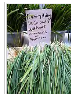
Organic vegetables at a farmers' market

With respect to chemical differences in the composition of organically grown food compared with conventionally grown food, studies have examined differences in nutrients, antinutrients, and pesticide residues. These studies generally suffer from confounding variables, and are difficult to generalize due to differences in the tests that were done, the methods of testing, and because the vagaries of agriculture affect the chemical composition of food; these variables include variations in weather (season to season as well as place to place); crop treatments (fertilizer, pesticide, etc.); soil composition; the cultivar used, and in the case of meat and dairy products, the parallel variables in animal production. [3][6] Treatment of the foodstuffs after initial gathering (whether milk is pasteurized or raw), the length of time between harvest and analysis, as well as conditions of transport and storage, also affect the chemical composition of a given item of food. [3][6] Additionally, there is evidence that organic produce is drier than conventionally grown produce; a higher content in any chemical category may be explained by higher concentration rather than in absolute amounts. [4]