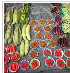
Organic vegetables at a farmers' market in Argentina

There is not sufficient evidence in medical literature to support claims that organic food is safer or healthier than conventionally grown food. While there may be some differences in the nutrient and antinutrient contents of organically- and conventionally-produced food, the variable nature of food production and handling makes it difficult to generalize results. [3][4][5][6][7] Claims that organic food tastes better are generally not supported by evidence. [4][8]