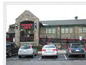
As of October 2014, Trader Joe's is a market leader of organic grocery stores in the United States. [111]