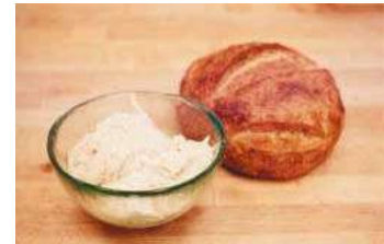
Sourdough starter is the key ingredient in sourdough bread.

Bread rises because tiny organisms in the dough are performing fermentation—absorbing sugar from the flour and processing it into gas and flavorful organic molecules. In commercially made bread, these organisms are yeasts, members of the fungus family. In starter, a population of bacteria and wild yeasts (different yeasts than those sold in the store) are thriving on a regular diet of flour and water. When this starter is put into bread dough, the bacteria and yeasts readily go to work processing the sugars in the dough; no commercial yeast is needed. In addition to the usual fermentation products, the bacteria produce acids that give the resulting bread unique flavors.