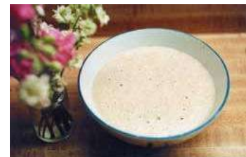
Bubbles such as these are a good sign that your starter is alive.

4-1/4 cups white flour 1/4 cup whole wheat flour 1/3 of the fully risen starter 1-1/2 cups water