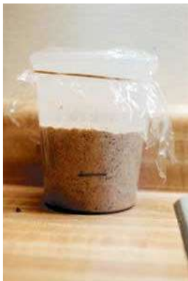
An ideal container for growing a sourdough starter is see-through, with a loose-fitting lid.

To get that first little bit of starter, a mixture of flour and water is left out. Bacteria and wild yeasts from the air move in. With regular feeding, they can become a stable population, strong enough to make bread rise. In addition, once the starter is stable, it can survive in the refrigerator and be fed only once every few weeks. Creating a starter is not a walk in the park. The bread-making bacteria struggle to gain hold; sometimes, bad bacteria take over. But the process is doable, especially if you know the pitfalls to avoid. And the reward of making bread with your very own starter is well worth the effort.