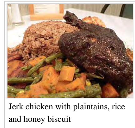
Jerk chicken with plantains, rice and honey biscuit

This region comprises the cultures of the Arawaks, the Caribs, and the Ciboney. The Taíno of the Greater Antilles were the first New World people to encounter Columbus. Prior to European contact, these groups foraged, hunted, and fished. The Taíno cultivated cassava, sweet potato, maize, beans, squash, pineapple, peanut, and peppers. Today these groups have mostly vanished, but their culinary legacy lives on.