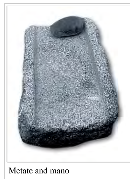
Metate and mano