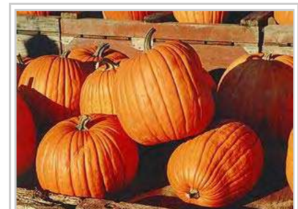
Several large pumpkins