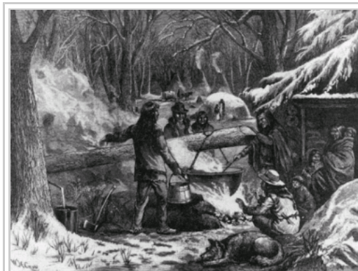
A 19th-century illustration, "Sugar-Making Among the Indians in the North". Aboriginal peoples living in the northeastern part of North America were the first people known to have produced maple syrup and maple sugar

Southeastern Native Americans also supplemented their diets with meats derived from the hunting of native game. Venison was an important meat staple, due to the abundance of white-tailed deer in the area. They also hunted rabbits, squirrels, opossums, and raccoons. Livestock, adopted from Europeans, in the form of hogs and cattle, were kept. Aside from the meat, it was not uncommon for them to eat organ meats such as liver, brains, and intestines. This tradition remains today in hallmark dishes like chitterlings, commonly called chitlins, which are the fried large intestines of hogs; livermush, a common dish in the Carolinas made from hog liver; and pork brains and eggs. The fat of the animals, particularly of hogs, was rendered and used for cooking and