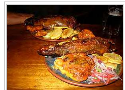
Roast guinea pig (cuy)