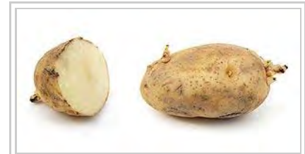
A Russet potato with sprouts