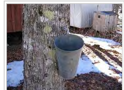
A maple syrup tap