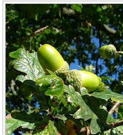
Acorns of Sessile Oak. The acorn, or oak nut, is the nut of the oaks and their close relatives (genera Quercus and Lithocarpus , in the family Fagaceae ).