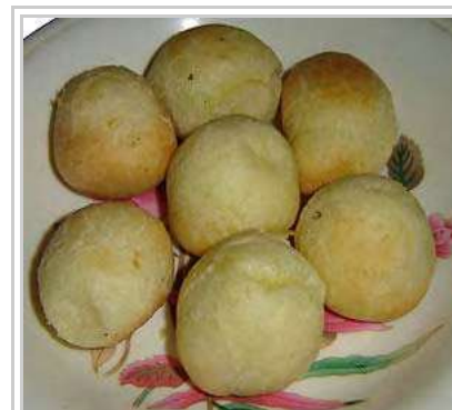
Chipa, cheese bread