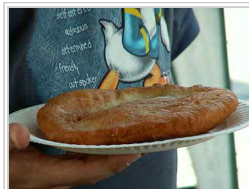
Frybread is a staple food of Native American cuisine. [1]

Modern-day Native American cuisine is varied. [2][3] The use of indigenous domesticated and wild food ingredients can represent Native American food and cuisine. [4] North American native cuisine can differ somewhat from Southwestern and Mexican cuisine in its simplicity and directness of flavor. The use of ramps, wild ginger, miners' lettuce, and juniper berry can impart subtle flavours to various dishes. Different ingredients can change the whole meaning of Native American cuisine. A chef preparing a Native American dish can adopt, create, and alter as their imagination dictates. [5]