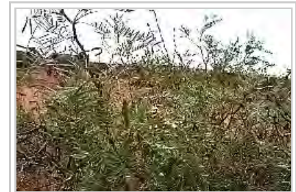
The bean pods of the mesquite (above) can be dried and ground into flour, adding a sweet, nutty taste to breads