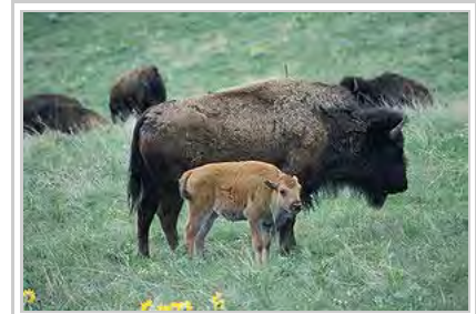
Bison cow and calf