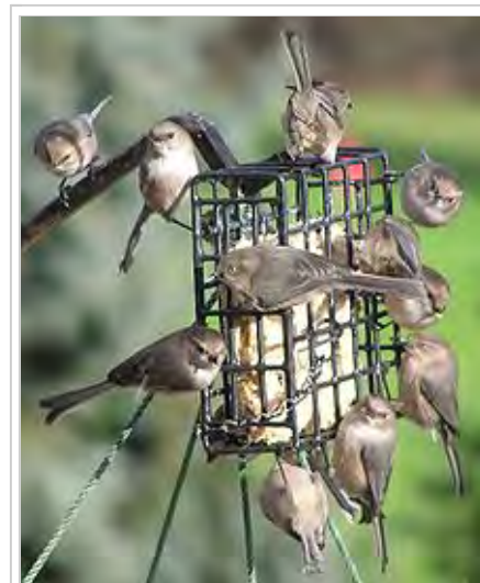
Bushtits eating suet from a bird feeder

Raw feeding is the practice of feeding domestic dogs and cats a diet consisting primarily of uncooked meat and bones. Supporters of raw feeding believe the natural diet of an animal in the wild is its most ideal diet and try to mimic a similar diet