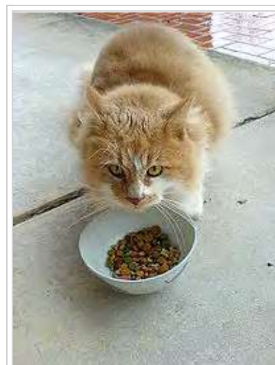
Cat with a bowl of pelleted cat food.