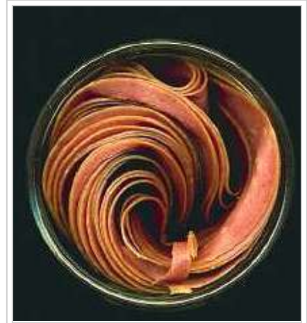
Slices of beef in a can.