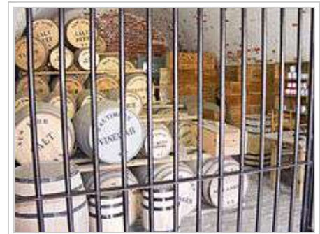
Barrels of salt beef in a reconstruction of an American Civil War stockpile, at Fort Macon State Park, North Carolina

Scientific research on meat by chemists and pharmacists led to the creation of a new, extremely practical product: meat extract, which could appear in different forms. The need to properly feed soldiers during long campaigns outside the country, such as the Napoleonic Wars, and to nourish a constantly growing population often living in appalling conditions drove scientific research, but a confectioner, Nicolas Appert, in 1795 developed through experimentation a method which would become universal and in one language bears his name: airtight storage, called appertisation in French.