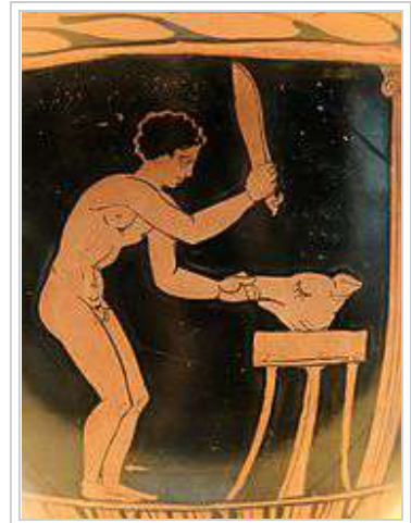
Young man preparing a pig's head after a sacrifice. Vase v. 360-340 BC, National Archaeological Museum of Spain

A trade in salt meat occurred across ancient Europe. In Polybius's time, [8] the Gauls exported salt pork each year to Rome in large quantities, where it was sold in different cuts: rear cuts, middle cuts, hams, and sausages. This meat, after having been salted with the greatest care, was sometime smoked. These goods had to have been considerably important, since they fed part of the Roman people and the armies. The Belgians were celebrated above all for the care which they gave to the fattening of their pigs. Their herds of sheep and pigs were so many, they could provide skins and salt meat not only for Rome, but also for most of Italy. The Ceretani of Spain drew a large export income from their hams, which were so succulent, they were in no way inferior to those of Cantabria. These tarichos of pig would become especially sought, to the point that the ancients considered this meat the most nourishing of all and the easiest to digest. [6]