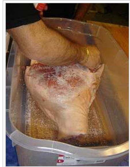
Sea salt being added to raw ham to make prosciutto

While meat preservation processes like curing were mainly developed in order to prevent disease and increase food security, the advent of modern preservation methods mean that in most developed countries today, curing is instead mainly practised for its cultural value and desirable impact on the texture and taste of food. For lesser-developed countries, curing remains a key process in ensuring the viability of meat production, transport and access.