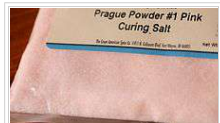
Curing salt, also known as "Prague powder" or "pink salt", is typically a combination of sodium chloride and sodium nitrite that is dyed pink to distinguish it from table salt.