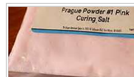
Bag of Prague powder #1, also known as "curing salt" or "pink salt". It is typically a combination of salt and sodium nitrite, with the pink color added to distinguish it from ordinary salt.

Lack of quality control in the canning process may allow ingress of water or micro-organisms. Most such failures are rapidly detected as decomposition within the can causes gas production and the can will swell or burst. However, there have been examples of poor manufacture (underprocessing) and poor hygiene allowing contamination of canned food by the obligate anaerobe Clostridium botulinum , which produces an acute toxin within the food, leading to severe illness or death. This organism produces no gas or obvious taste and remains undetected by taste or smell. Its toxin is denatured by cooking, however. Cooked mushrooms, handled poorly and then canned, can support the growth of Staphylococcus aureus , which produces a toxin that is not destroyed by canning or subsequent reheating.