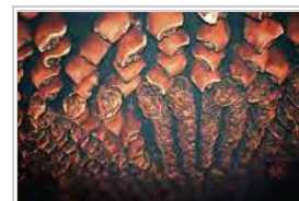
Smoked ham in a smokehouse in Schleswig-Holstein, Germany