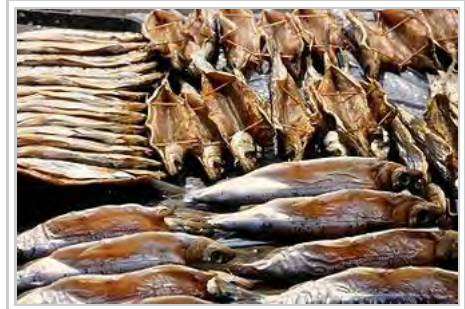
Smoked omul fish, endemic to Lake Baikal in Russia, on sale at Listyanka market.