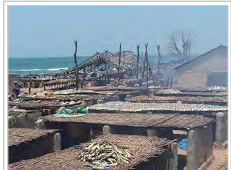
Fish being smoked in Tanji, The Gambia