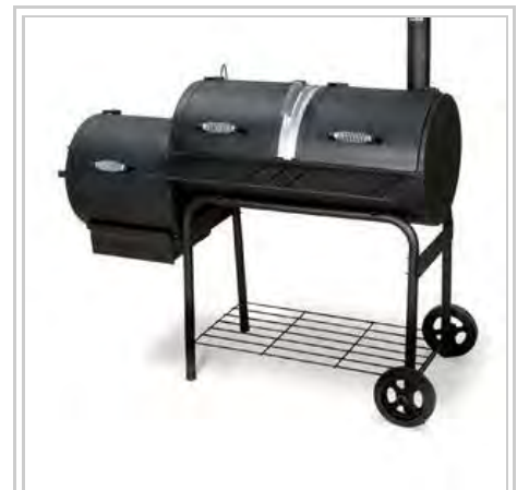
An example of a common offset smoker.

The heat and smoke cook and flavor the meat before escaping through an exhaust vent at the opposite end of the cooking chamber. Most manufacturers' models are based on this simple but effective design, and this is what most people picture when they think of a "BBQ smoker." Even large capacity commercial units use this same basic design of a separate, smaller fire box and a larger cooking chamber.