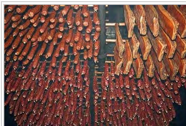
Meat hanging inside a smokehouse in Switzerland.

The smoking of food directly with wood smoke is known to contaminate the food with carcinogenic polycyclic aromatic hydrocarbons. [2]