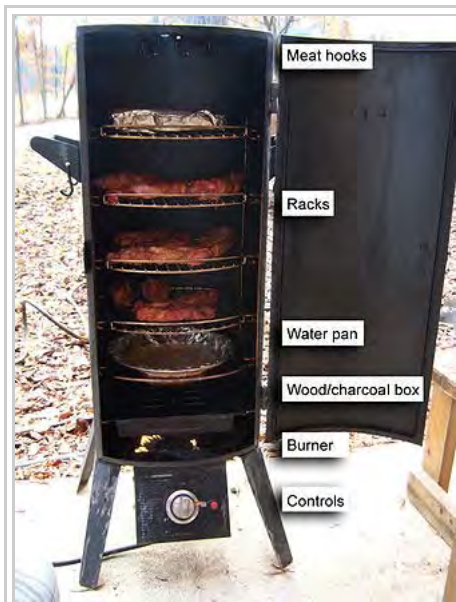
A diagram of a propane smoker, loaded with country style ribs and pork loin in foil.

A propane smoker is designed to allow the smoking of meat in a somewhat more controlled environment. The primary differences are the sources of heat and of the smoke. In a propane smoker, the heat is generated by a gas burner directly under a steel or iron box containing the wood or charcoal that provides the smoke. The steel box has few vent holes, on the top of the box only. By starving the heated wood of oxygen, it smokes instead of burning. Any combination of woods and charcoal may used. This method uses less wood.