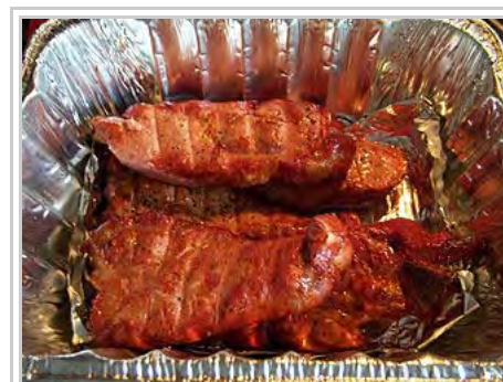
Hickory-smoked country-style ribs.

Cellulose and hemicellulose are aggregate sugar molecules; when burnt, they effectively caramelize, producing carbonyls, which provide most of the color components and sweet, flowery, and fruity aromas. Lignin, a highly complex arrangement of interlocked phenolic molecules, also produces a number of distinctive aromatic elements when burnt, including smoky, spicy, and pungent compounds such as guaiacol, phenol, and syringol, and sweeter scents such as the vanilla-scented vanillin and clove-like isoeugenol. Guaiacol is the phenolic compound most responsible for the "smokey" taste, while syringol is the primary contributor to smokey aroma. [7] Wood also contains small quantities of proteins, which contribute roasted flavors. Many of the odor compounds in wood smoke, especially the phenolic compounds, are unstable, dissipating after a few weeks or months.