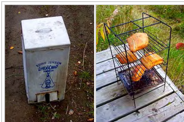
A "Little Chief" home smoker and racks with hot smoked Pacific halibut

Hot smoking exposes the foods to smoke and heat in a controlled environment. Like cold smoking, the item is hung first to develop a pellicle, then smoked. Although foods that have been hot smoked are often reheated or cooked, they are typically safe to eat without further cooking. Hams and ham hocks are fully cooked once they are properly smoked. Hot smoking occurs within the range of 52 to 80 °C (126 to 176 °F). [6] Within this temperature range, foods are fully cooked, moist, and flavorful. If the smoker is allowed to get hotter than 185 °F (85 °C), the foods will shrink excessively, buckle, or even split. Smoking at high temperatures also reduces yield, as both moisture and fat are "cooked" away.