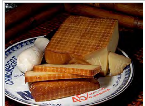
Smoked Gruyère cheese