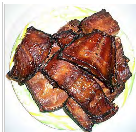
Hot-smoked chum salmon