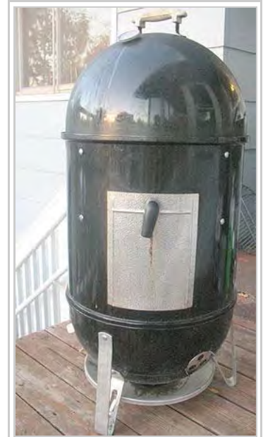
A typical vertical water smoker

A vertical water smoker (also referred to as a bullet smoker because of its shape) [8] is a variation of the upright drum smoker. It uses charcoal or wood to generate smoke and heat, and contains a water bowl between the fire and the cooking grates. [8] The water bowl serves to maintain optimal smoking temperatures [8] and also adds humidity to the smoke chamber. It also creates an effect in which the water vapor and smoke condense together, which adds flavor to smoked foods. [8] In addition, the bowl catches any drippings from the meat that may cause a flare-up. Vertical water smokers are extremely temperature stable and require very little adjustment once the desired temperature has been reached. Because of their relatively low cost and stable temperature, they are sometimes used in barbecue competitions where propane and electric smokers are not allowed.