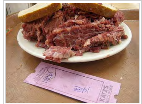
Pastrami, a smoked and cured beef product