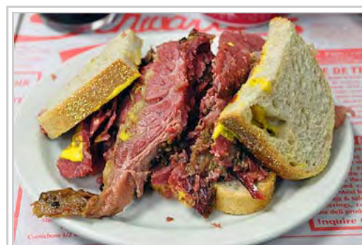
A Montreal Smoked Meat Sandwich, a well-known Canadian dish.