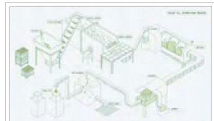
Modern method of olive oil extraction