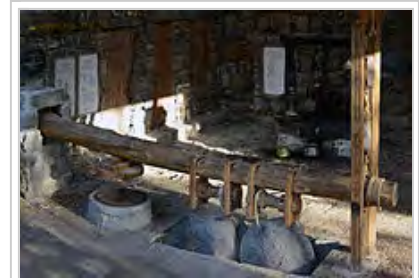
Oil press in the Israeli settlement Katzrin

After grinding, the olive paste is spread on fiber disks, which are stacked on top of each other, then placed into the press. Traditionally the disks were made of hemp or coconut fiber, but in modern times they are made of synthetic fibers which are easier to clean and maintain.