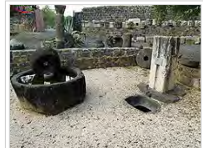
An olive mill and an olive press dating from Roman times in Capernaum

Olive oil extraction is the process of extracting the oil present in olive drupes, known as olive oil. Olive oil is produced in the mesocarp cells, and stored in a particular type of vacuole called a lipo vacuole, i.e., every cell contains a tiny olive oil droplet. Olive oil extraction is the process of separating the oil from the other fruit contents (vegetative extract liquid and solid material). It is possible to attain this separation by physical means alone, i.e., oil and water do not mix, so they are relatively easy to separate. This contrasts with other oils that are extracted with chemical solvents, generally hexane. [1] The first operation when extracting olive oil is washing the olives, to reduce the presence of contaminants, especially soil which can create a particular flavor defect called "soil taste".