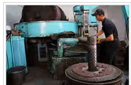
Olive paste after stone crushing is being applied to fiber mats in Sicily