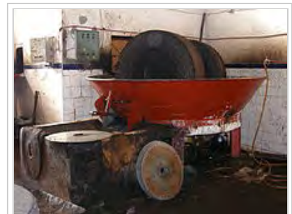
Grinder with two millstones and in the foreground several fiber disks