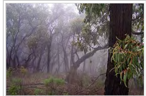
Mediterranean eucalypt forest in Australia