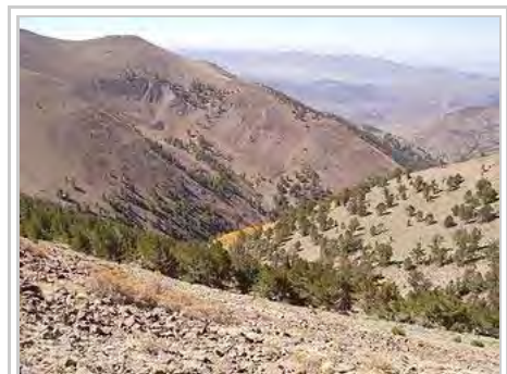
Limber Pine woodland in the Toiyabe Range of central Nevada