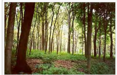
A woodland ecosystem at Morton Arboretum in Illinois