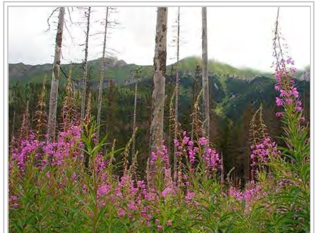
Woodland in Belianske Tatras in Slovakia.

Woodlot is a closely related American term, which refers to a stand of trees generally used for firewood. While woodlots often technically have closed canopies, they are so small that light penetration from the edge makes them ecologically closer to woodland than forest.