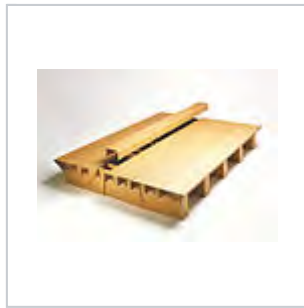
Pappbett cardboard bed, by Hans-Peter Stange, Berlin 1989