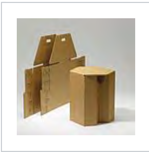
Falthocker cardboard stool, by Hans-Peter Stange, Berlin 1979