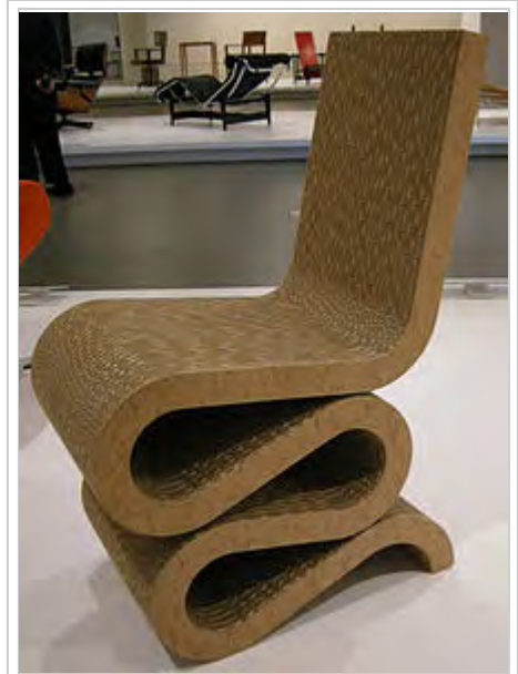
Wiggle side chair by Frank Gehry for NGV Design, 1972

In the Beginning of the 1980s cardboard furniture becomes very popular in France by the technique of Eric Guiomar. It is totally different to the technique of Frank Gehry. The furniture in the technique of Guiomar is made with corrugated cardboard, simple, double and triple groove. First, a frame is created with intertwined cardboard plates which are cut out according to the original design. This is the support