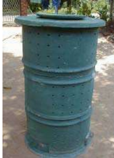
Bin with modifications

When bin designs were identified at the beginning, it did not include aeration holes in the bottom ring. Aeration is a critical factor for composting process and as a result, delayed composting and bad odour problems were identified.