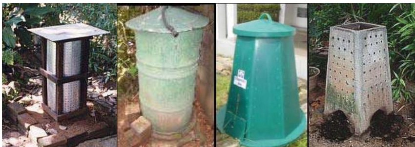
Plate: Different composting bin designs available in Sri Lanka.

Bin composting is the most popular and advance version of home composting system that overcomes problems experienced in other composting systems. There are different types of bins available for home composting and generally it varies from 200- 300L in size. These are from different materials such as cement/concrete, plastic, metal, etc. The bins allow higher stacking of composting materials and better use of floor space than free-standing piles. Bins can also eliminate weather problems and reduce problems of odours, and provide better temperature control. At present, most bins are designed to suit the urban landscape as well.