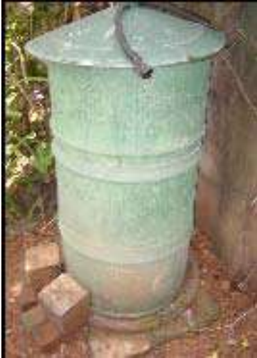
Concrete bin widely used in Sri Lanka