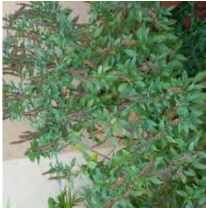
Uploaded 7 months ago