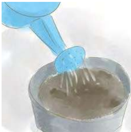
Uploaded 2 years ago