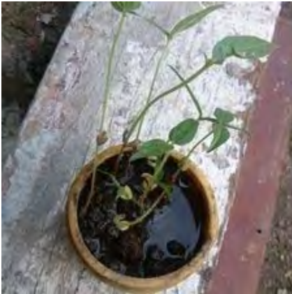
Uploaded 3 months ago