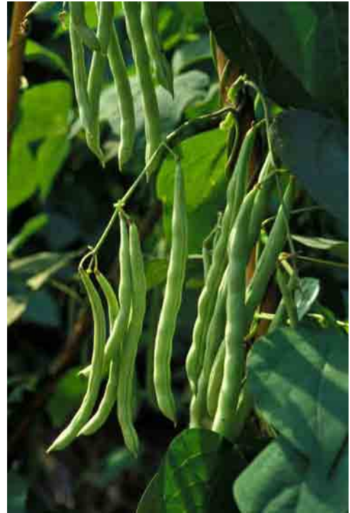
Fig. 7. Maturing bean pods

Pods are harvested when they have turned yellow but are not yet completely dry. The inner seeds will be firm, well developed, and beginning to loosen inside the pods. Harvesting is often done in the morning to avoid losses due to shattering.