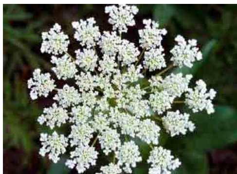
Fig. 10. Cluster of carrot flowers (umbel)

Carrot plants produce perfect flowers (Fig. 10) that are pollinated by insects. Separate