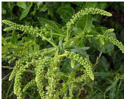
Fig. 8. Seed stalk of beet

Store stalks in a cool dry location for 2–3 weeks to encourage further seed ripening. Do not heap stalks on top of one another since this causes seeds to ferment. Handle stalks as little as possible since seeds shed easily. Small quantities of seed can be stripped by hand as seed matures. Large numbers of stalks can be put into a bag and beat with a stick. Chaff is winnowed away.