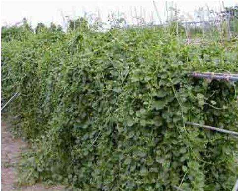
Fig. 30. Malabar spinach growing on a trellis

Malabar spinach grows well in hot, humid climates and is adaptable to most soils. Trellised plants work best from the point of view of flower induction, fruit harvesting and crop management (Fig. 30). Short days (13 hours or less) are required for flowering.