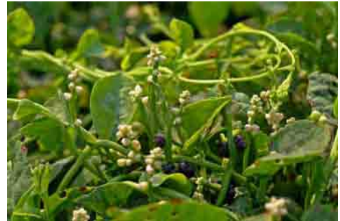
Fig. 31. Flowers and mature fruits

Harvest mature fruits with dark purple color (Fig. 31). The vines sometimes turn brown or yellow at this stage. Fruits may be harvested singly or in clusters.