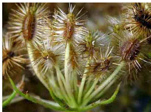
Fig. 11. Cluster of mature seeds

Allow seed to mature in a cool, dry location for an additional 2–3 weeks. Seeds can be removed by hand-beating or rubbing umbels between hands. Winnow to clean. Remove spines from dry seed by rubbing.