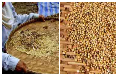
Figs. 43, 44. Winnowing to remove chaff