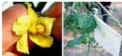
Figs. 14, 15. Pollen on anther of male flower is rolled onto stigma of female flower (left) and the female flower is bagged (right)

Hand pollination. Cap or bag female and male flower buds on the same plant or nearby plant of the same variety. Then select male flowers when they bloom, turn over their petals to expose their anthers, and gently roll the anthers over the stigma of the just bloomed female flowers (Fig. 14); you can see a layer of pollen has been transferred on the stigma. After pollination, cap or bag the female flower again to exclude insects (Fig. 15). Mark the pollinated female flower by wrapping a string to the pedicel.