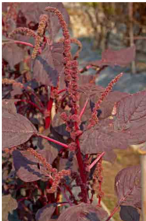
Fig. 6. Maturing seed stalks of amaranth

A lightening or yellowing of foliage color is an indication that seeds are beginning to mature (Fig. 6). Types with an apical inflorescence are usually harvested once. Types with several side shoots are harvested several times as the seeds mature. The harvested seed stalks are placed on a clean tarpaulin or into very fine mesh nylon bags and allowed to dry in the shade.