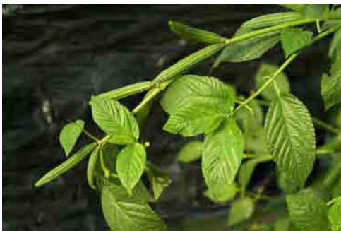
Fig. 22. Healthy and vigorous jute plant with seed capsules

Select plants that are uniform in appearance, healthy and vigorous (Fig. 22). Cover flow-