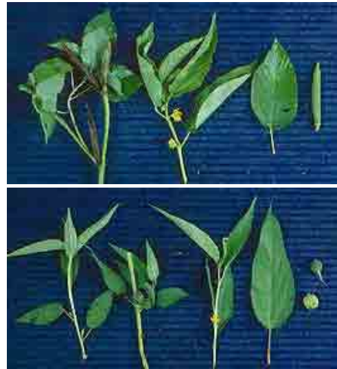
Figs. 23, 24. Popular species Corchorus olitorius (top photo) and C. capsularis (bottom photo) are closely related, differing mainly in pod shape

Among the more than 15 species of Corchorus , two are most common: C. olitorius and C. capsularis . The former produces long capsules while the latter produces round capsules (Figs. 23, 24). Both types of capsules are harvested when fully mature but before seeds begin to shatter.