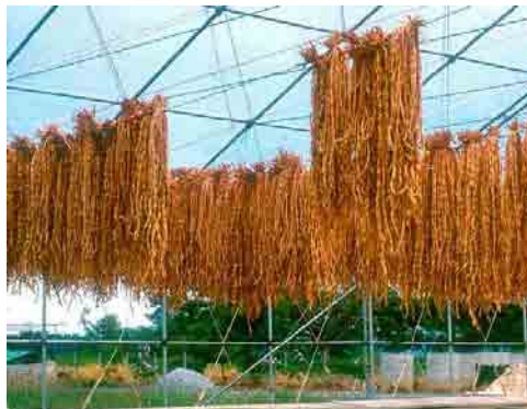
Fig. 52. Yardlong bean pods hung in bundles for drying

Pods are dried in the sun for approximately 3 days (Fig. 52). For small amounts, pods may be opened by hand. For large amounts, hang the pods in a burlap bag and beat them with a stick, or put on the floor and walk on them. Remove large chaff by hand or winnowing. Discard blemished and shriveled seeds. Place remaining seeds under shade for 1–2 weeks for further drying.