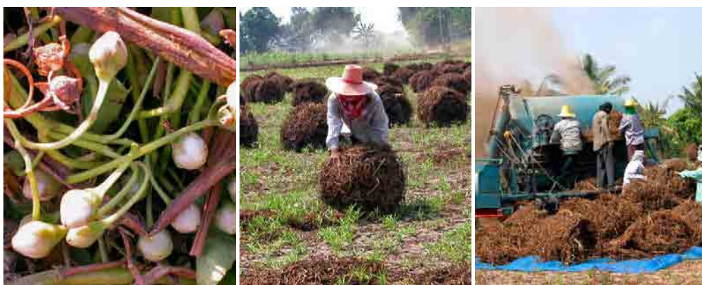
Figs. 25–27. Mature seed pods (left); rolling plants into loose bundles for drying (center); mechanical threshing of dried plants (right)

Kangkong seed will store for up to two years, a shorter time compared to most vegetable crops. Storage pests are a problem if seed moisture content is high.