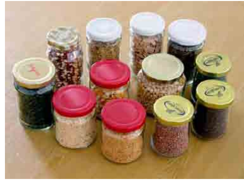
Fig. 5. Seeds stored in air-tight containers to prevent them from absorbing moisture

Temperature. For most vegetable seeds, a temperature below 15 °C is ideal. You can keep the seeds in an air-tight container and place the container in the refrigerator. For short-term storage, keep the seeds in a cool and shady dry place.