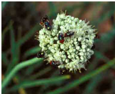
Fig. 36. Insects pollinating onion flowers

Bulb-to-seed. Harvest in the fall and select the largest bulbs (which naturally produce more seed). Clip tops to 15 cm and cure for three to four weeks. After the bulbs