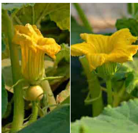
Figs. 12, 13. Female (left) and male (right) flowers of squash

Most cucurbit plants produce separate male and female flowers on the same plant. Female flowers can be identified by locating the ovary (a small looking cucumber, melon, gourd, etc.) at the base of the flower (Fig. 12). The flowers are insect-pollinated, and easily cross within species. However, seed savers can grow more than one variety at a