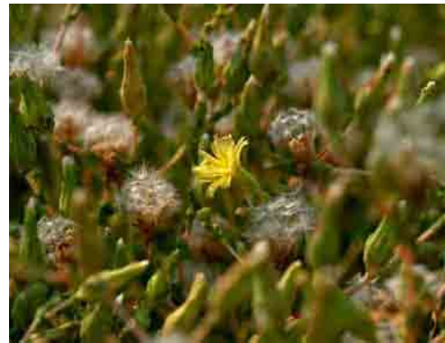
Fig. 29. Shattering seeds