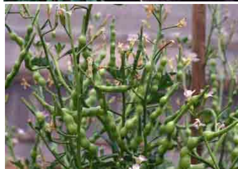
Figs. 39, 40. Radish roots (top) and ripening seed pods (bottom)