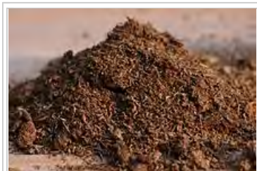
Peat moss soil amendment, made of partly decayed, dried sphagnum moss.

Decayed, dried sphagnum moss has the name of peat or peat moss. This is used as a soil conditioner which increases the soil's capacity to hold water and nutrients by increasing capillary forces and cation exchange capacity. This is often necessary when dealing with very sandy soil, or plants that need increased or steady moisture content to flourish. A distinction is sometimes made between sphagnum moss, the live moss growing on top of a peat bog, and 'sphagnum peat moss' (North American usage) or 'sphagnum peat' (British usage), the latter being the slowly decaying matter underneath. [21]