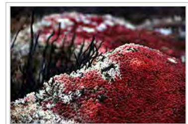
Red sphagnum closeup

The reciprocal monophyly of these sections and two other minor ones ( Rigida and Squarrosa ) has been clarified using molecular phylogenetics. [11] All but two species normally identified as Sphagnum reside in one clade; two other species have recently been separated into new families within the Sphagnaceae reflecting an ancestral relationship with the Tasmanian endemic Ambuchanania and long phylogenetic distance to the rest of Sphagnum . [12] Within main clade of Sphagnum , phylogenetic distance is relatively short, and molecular dating methods suggest nearly all current Sphagnum species are descended from a radiation that occurred just 14 million years ago. [13]