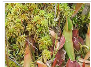
Sphagnum with Northern Pitcher Plants ( Sarracenia purpurea ) at Brown's Lake Bog, Ohio.

As with many other mosses, Sphagnum species disperse spores through the wind. The tops of spore capsules are only about 1 cm above ground, and where wind is weak. As the spherical spore capsule dries, the operculum is forced off, followed by a cloud of spores. The exact mechanism has traditionally attributed to a "pop gun" method using air compressed in the capsule, reaching a maximum velocity of 3.6 meters per second, [16] but alternative mechanisms have been