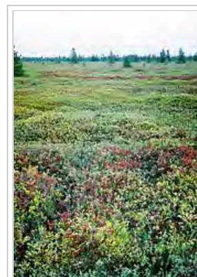
Mer Bleue Conservation Area, a large, protected Sphagnum bog near Ottawa, Ontario, Canada

PittMoss, a peat moss alternative made from recycled newspaper, has emerged as a sustainable substitute in growing media. [30] Coir has also been touted as a sustainable alternative to peat moss in growing media. [31] Another peat moss alternative is manufactured in California from sustainably harvested redwood fiber. Semi-open cell polyurethane materials available in flaked and sheet stock are also finding application as sphagnum replacements with typical usage in green wall and roof garden substrates. [32]