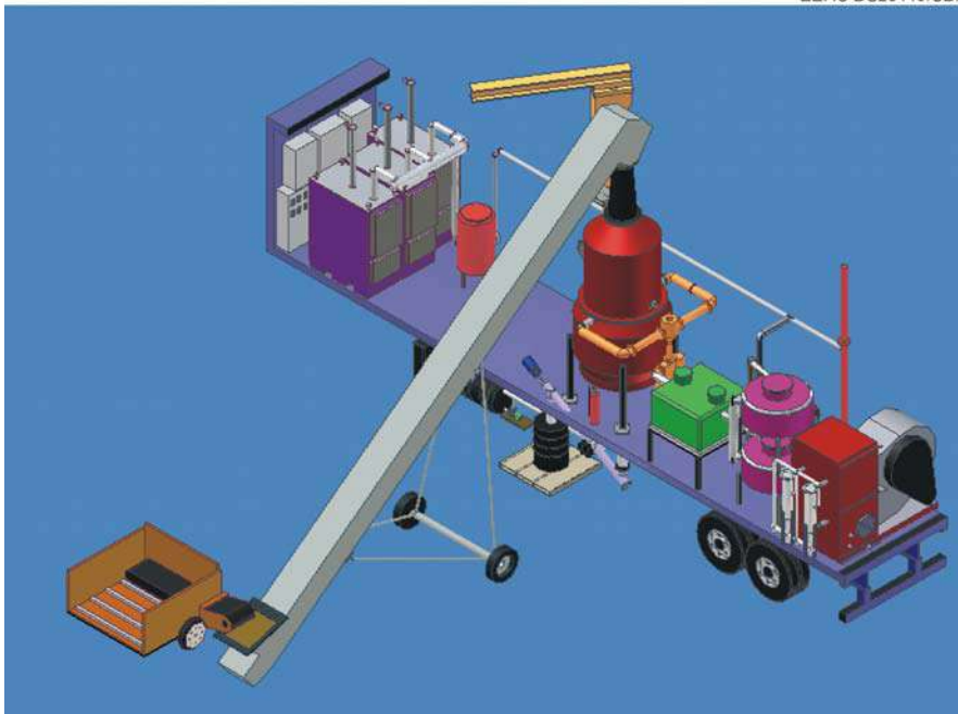
Figure 2. Portable gasification system and fuel.