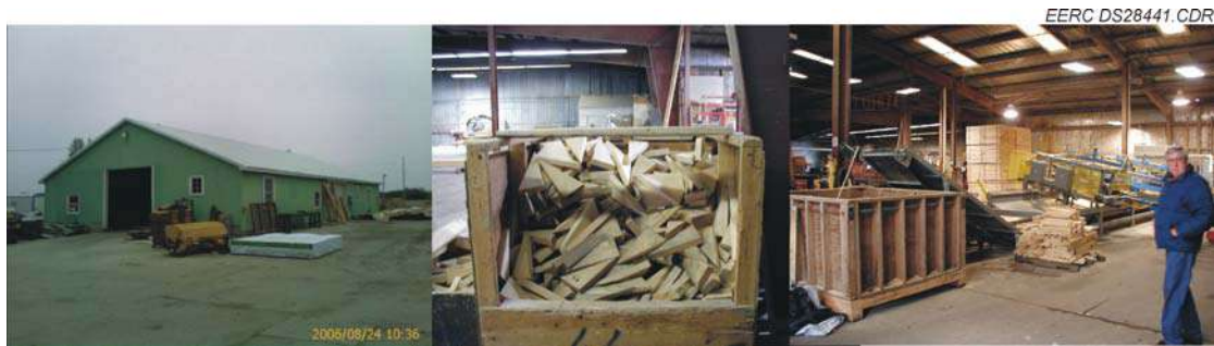
Figure 5. Project site.

data through the last quarter of 2007. The Grand Forks Truss Company, the building products manufacturer providing the wood waste for this project, will continue commercial operation of the process in the future.