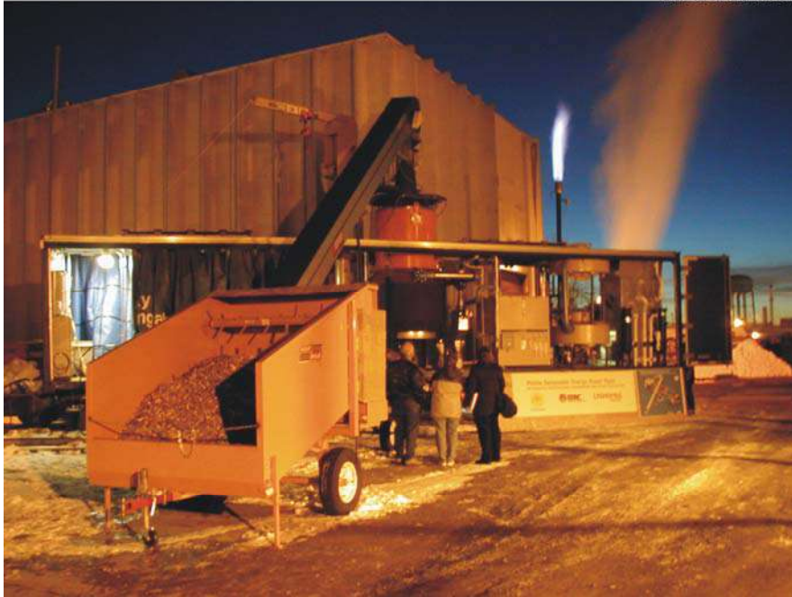
Figure 1. Portable gasification system in operation at the EERC.