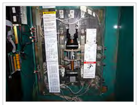
A Cummins Onan transfer switch

Many engine-generators use a reciprocating engine, with fuels mentioned above. This can