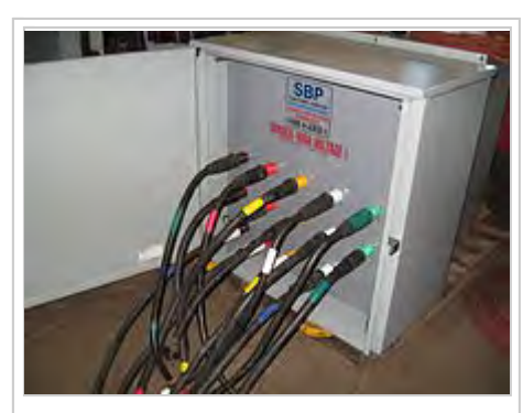
Generator tie-in panel 1200amp outdoor enclosure

Engine-generators are used to provide electrical power in areas where utility (central station) electricity is unavailable, or where electricity is only needed temporarily. Small generators are sometimes used to provide electricity to power tools at construction sites. Trailer-mounted generators supply provide for temporary installations of lighting, sound amplification systems, amusement rides etc.