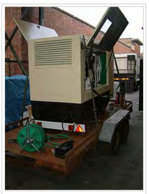
Side view of a large Perkins diesel generator, manufactured by FG Wilson Engineering Ltd. This is a 100 kVA set

The mid-size stationary engine-generator pictured here is a 100 kVA set which produces 415 V at around 110 A. It is powered by a 6.7-liter turbocharged Perkins Phaser 1000 Series engine, and consumes approximately 27 liters of fuel an hour, on a 400-liter tank. Diesel engines in the UK can run on red diesel and rotate at 1,500 or 3,000 rpm. This produces power at 50 Hz, which is the frequency used in Europe. In areas where the frequency is 60 Hz (United States), generators rotate at 1,800 rpm or another divisor of 3600. Diesel enginegenerator sets operated at their peak efficiency point can produce between 3 and 4 kilowatt hours of electrical energy for each liter of diesel fuel consumed, with lower efficiency at partial loads.