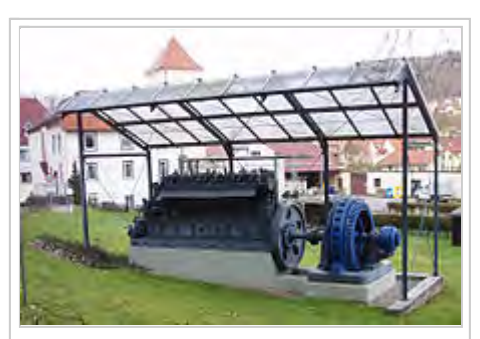
MAN diesel stationary engine and generator, now on outdoor museum display

be a steam engine, such as most coal-powered fossil-fuel power plants use. Some engine-generators use a turbine as the engine, such as the industrial gas turbines used in peaking power plants and the microturbines used in some hybrid electric buses.