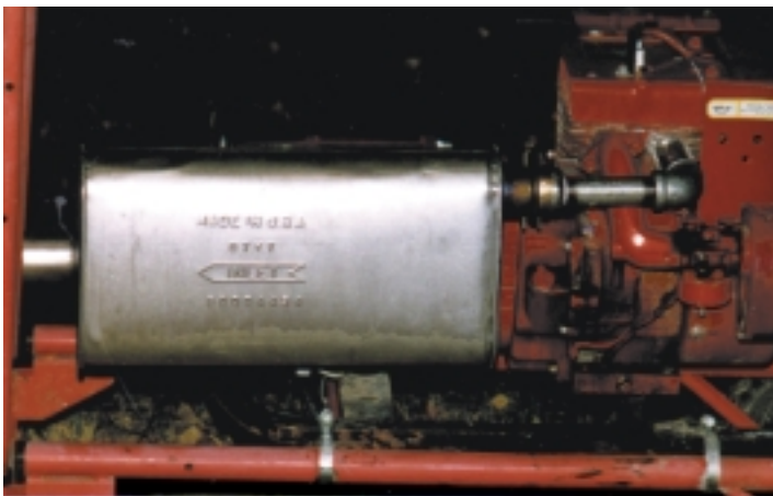
The finished unit

There are two secrets that make this a dream-come-true. First, a lot of small engines, like my eight-horse Tecumseh, use NPT to thread the muffler on. Briggs & Stratton uses NPT also, but in 1/2, 3/4, or 1-inch diameter. Mine has 3/4-inch threads. Check your engine, as you will need to know the size. The second secret is that the NPT connectors used to join pipes have a little smaller outside diameter than the inside diameter of an automotive