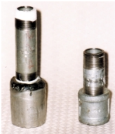
The before and after connector/adapters

The final thing we need is a connector/adaptor. Use either one. The result