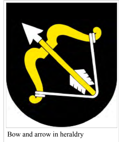
Bow and arrow in heraldry