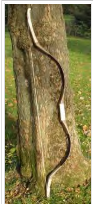
A modern reconstruction, in fiberglass and wood, of a historical composite bow